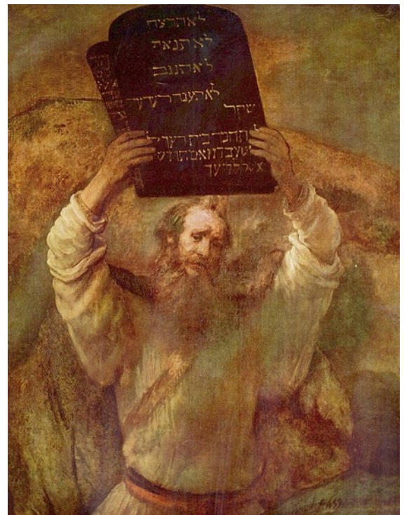
Moses breaks the tablets Rembrandt, 1659

For further information or options contact: office@knoxchurch.co.nz ph: 379 2456.